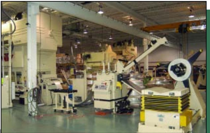
E2H-450 integrated coil line, includes a Machine Concepts straightener.

here right away. We need parts and we get them. We need help on the phone and we get it."