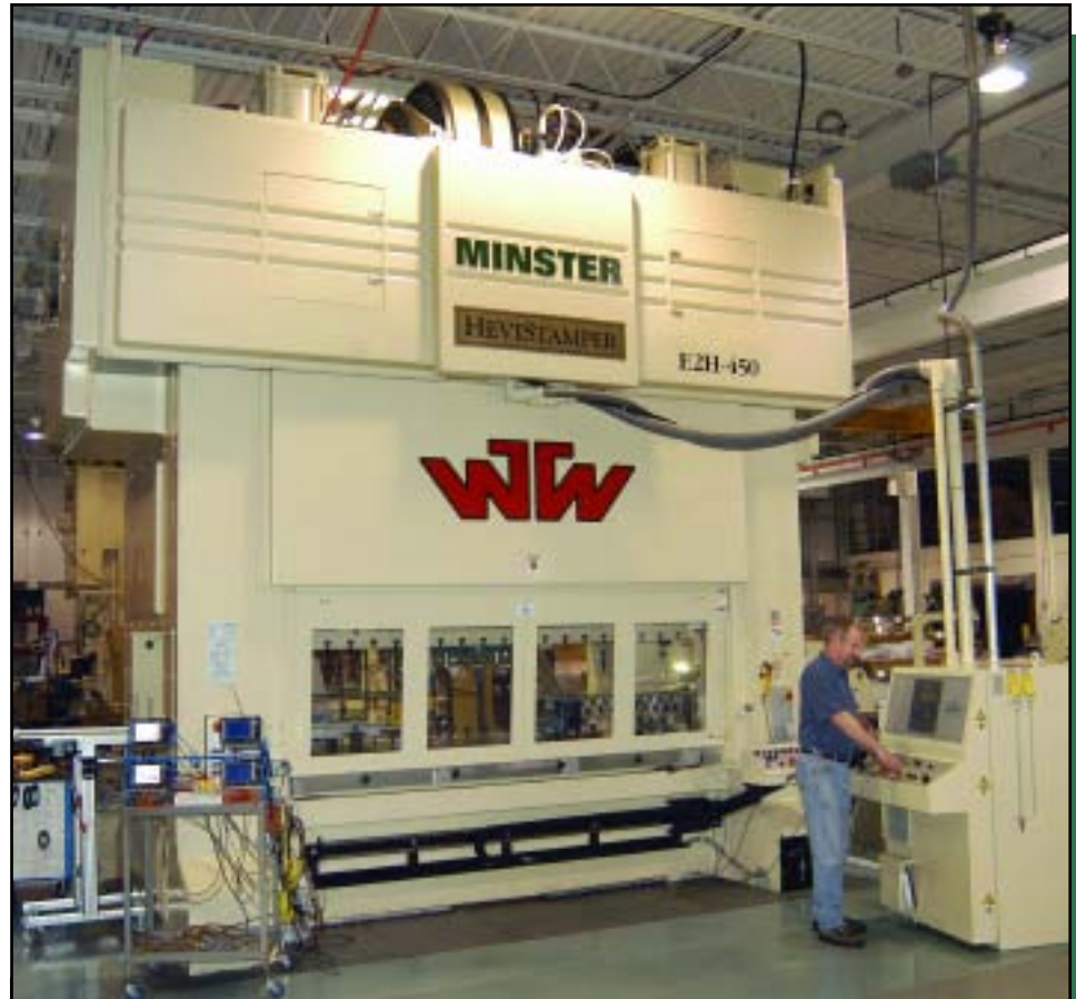
Minster E2H-450 press with Infinitely Adjustable Stroke at Wiegel Tool Works.

The latest technological investment at WTW is a Minster E2H-450 press equipped with the Infinitely Adjustable Stroke feature. And because supplying quality products to its