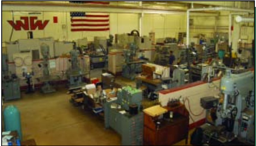
Wiegel builds complicated tooling in its state-of-the-art tool room.

"It's never an issue," he said. "We need service people and they are