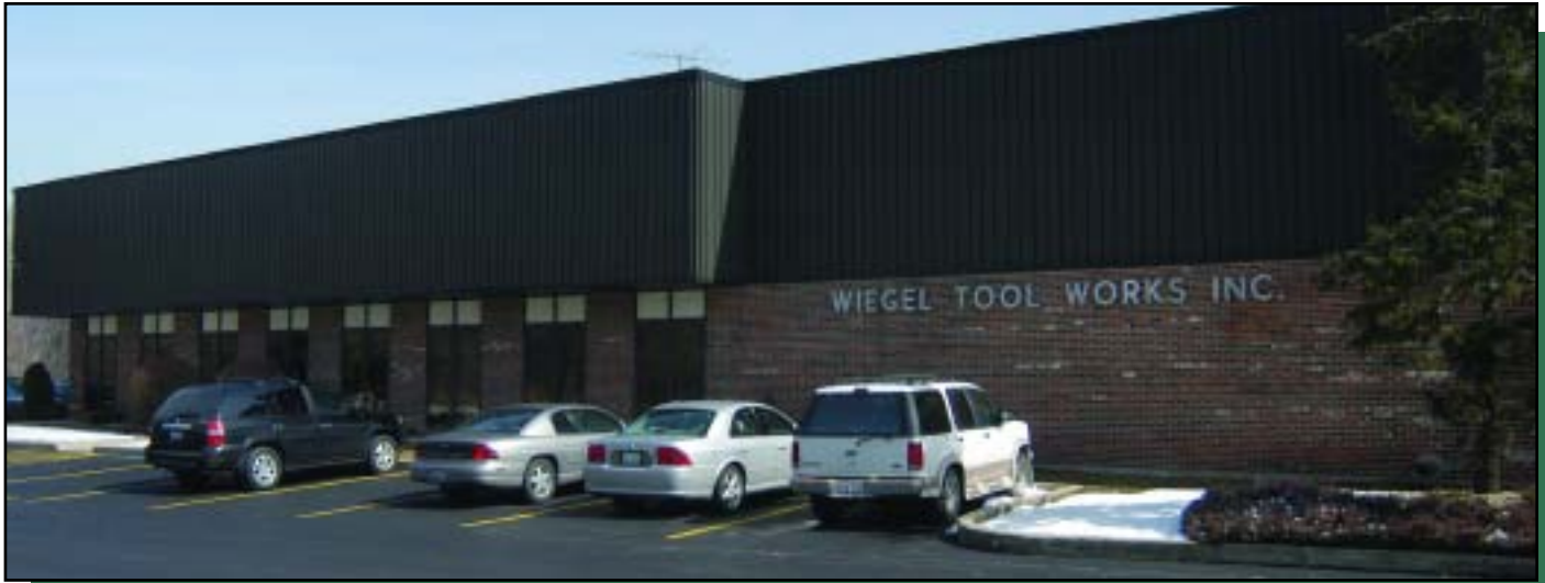
Wiegel Tool Works facility located in Wood Dale, IL, just about 15 minutes north of downtown Chicago.